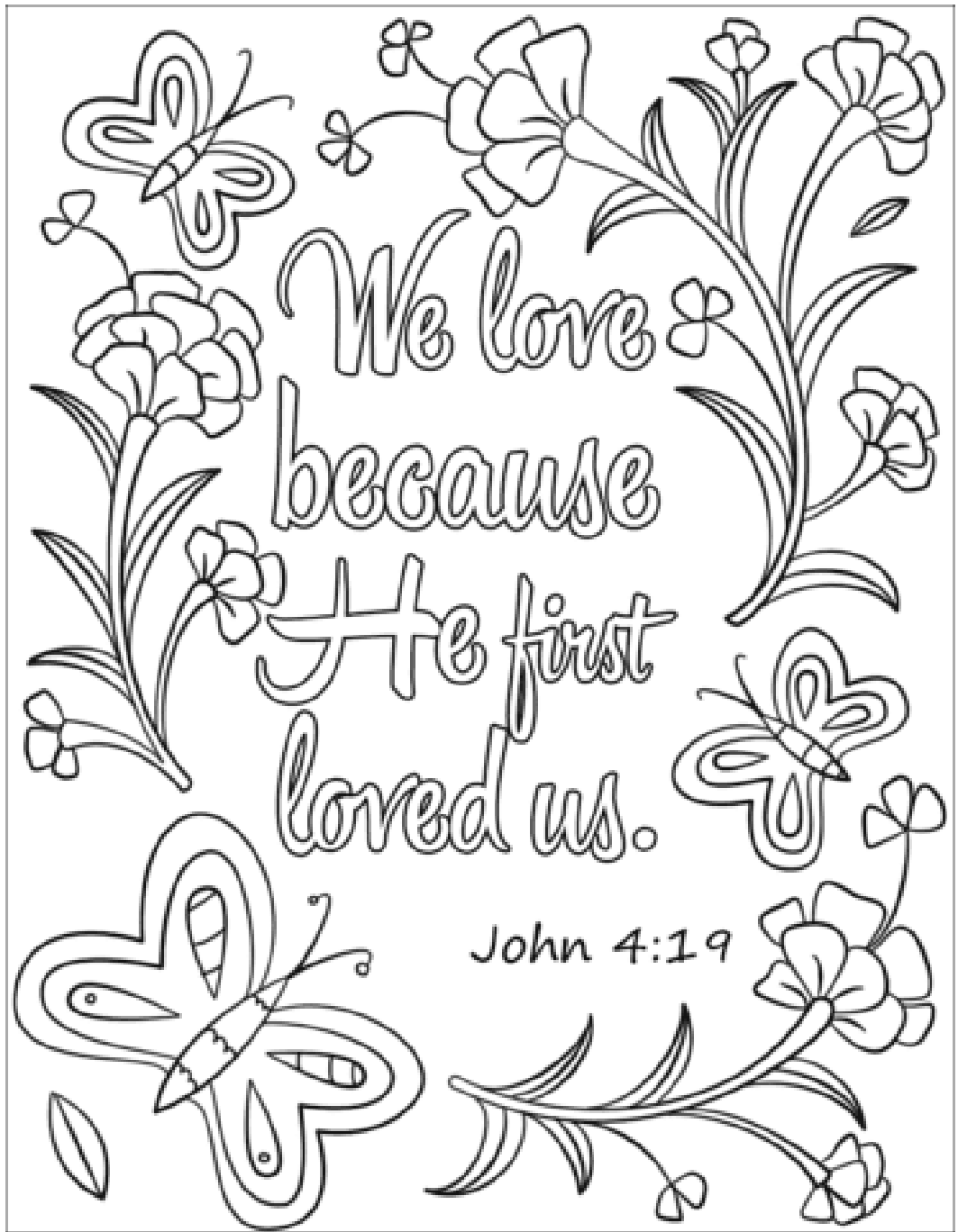
A coloring page for children and adults.